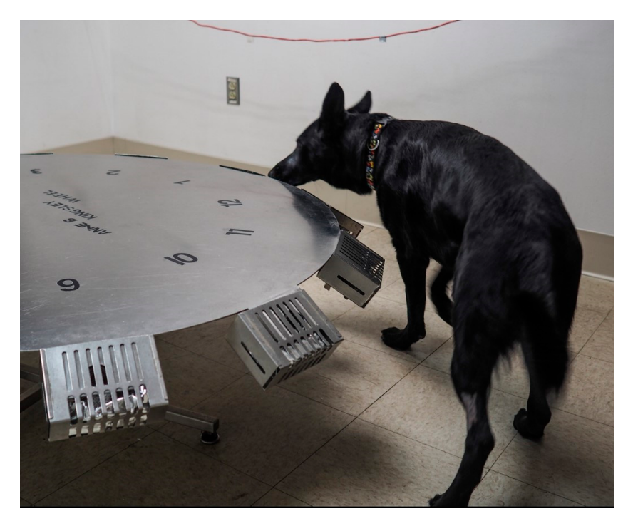
Figure 1. A dog searches the scent wheel—each port was numbered between 1 and 12 and held a different odor. These ports were then covered with metal grates to ensure the dogs could not come into contact with the odors.

was able to watch the dog work through a video connection into the wheel room in order to avoid influencing the search. Only one trial was carried out at each time point, where the dog was sent in and worked until they found the odor. When dogs successfully alerted on the UDC (Figure 2), the behavior would be marked with a click by the trainer (blind to the dog's treatment status) and the dogs would come out of the wheel room to receive a reward, either a toy or a food reward depending on the dog's preference.