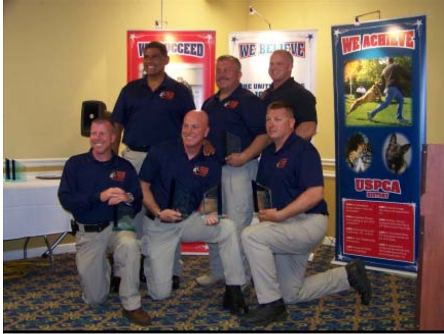
First Place 381.67 - Second Place 378.00 - Third Place 355.67 Lakeland P.D., Florida